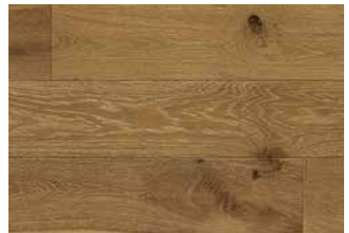
LA JOLLA DMBH2206