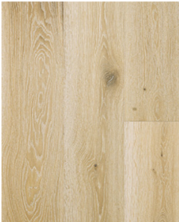
PALE TAN DMMF-1802