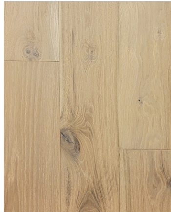
SOHO BEIGE DMMF-1811