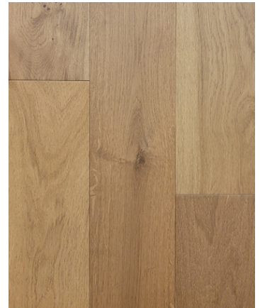
SAHARA SAND DMMF-1812