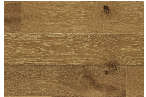
LA JOLLA DMBH2206