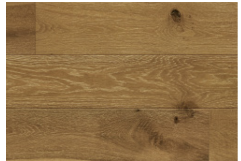
LA JOLLA DMBH2206