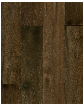
TIMBER COVE MCCA1209