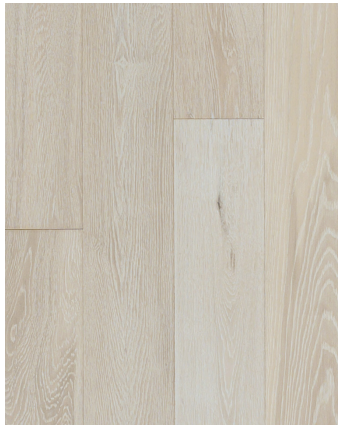
SEA SALT MCST1001