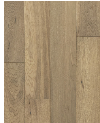
GREY LAGOON MCST1012