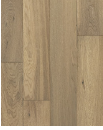
GREY LAGOON MCST1012