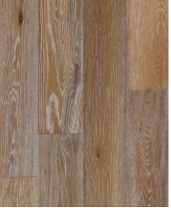
SEA SALT MCST1001