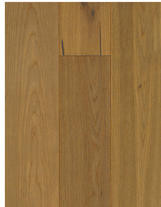
*KHAKI SUEDE DMSO-N03