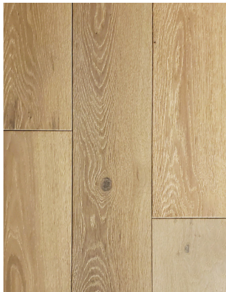
*DESERT SAND DMSO-N01