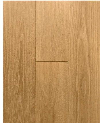
LUCID 6" SAL603 | 8" SAL803