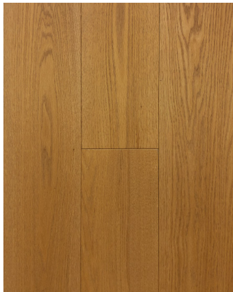
SEPIA 6" SAL605 | 8" SAL805