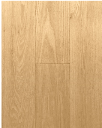
HALO 6" SAL602 | 8" SAL802