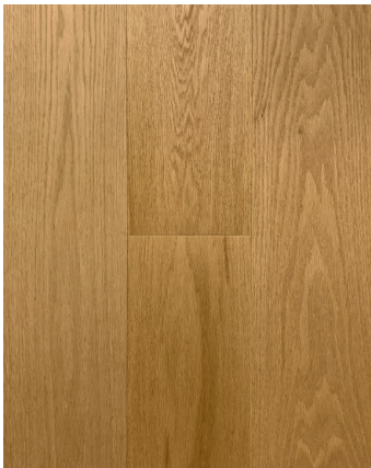
INTRIGUE 6" SAL604 | 8" SAL804