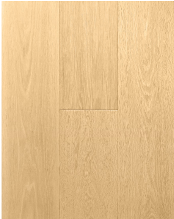
ARIA 6" SAL601 | 8" SAL801